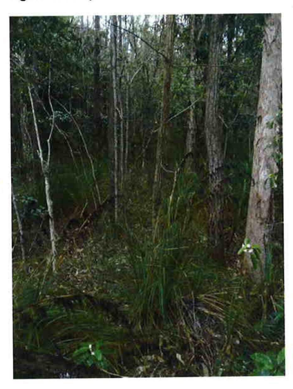
Figure 1: Subject land

To the southwest of the subject land lies Diemars Quarry, and to the southeast lies a manufactured home village. To the south of the site there is a biodiversity corridor which links Stoney Ridge to environmentally significant lands further south, and which is also part of Lot 51.